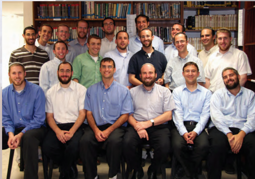
YESHIVAT HAKOTEL FACULTY