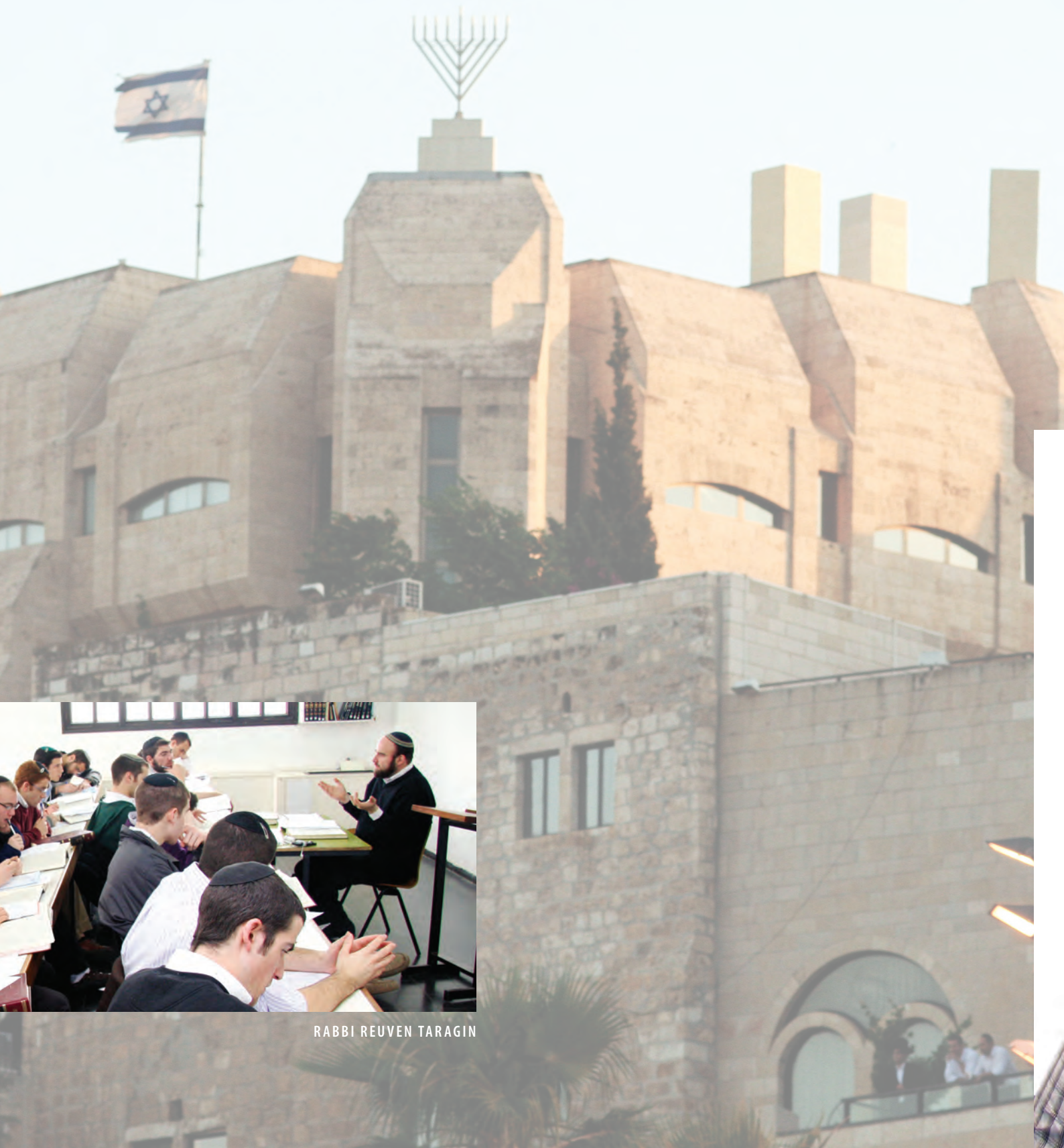
RABBI REUVEN TARAGIN